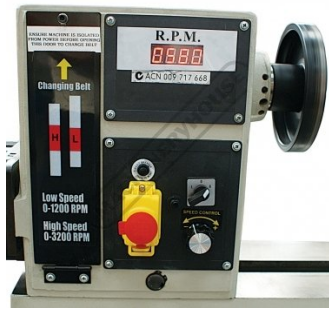
Variable Speed Display