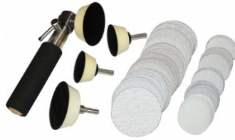
W305 Bowl Sanding Tool