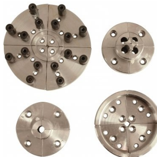
W375 Scroll Chuck Accessory Kit