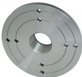
W298 Face Plate