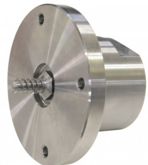
W297 Face Plate