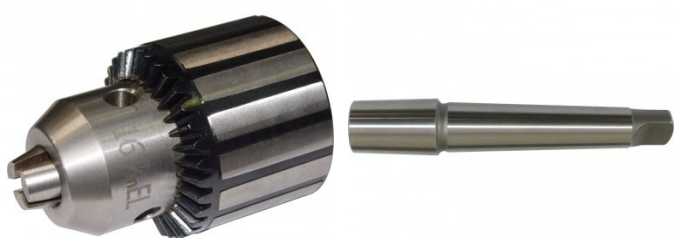
D442A 2MT x JT3 Drill Chuck Arbor