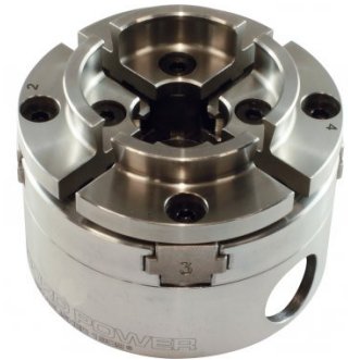
R8198 Scroll Chuck - 90mm - with Bonus 50mm Face Plate Ring