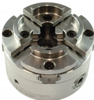
R8175 Scroll Chuck - 100mm - with Bonus 50mm Face Plate Ring