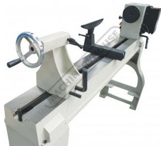
Heavy Cast Iron Legs