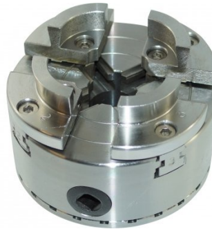
W370 Scroll Chuck - 100mm